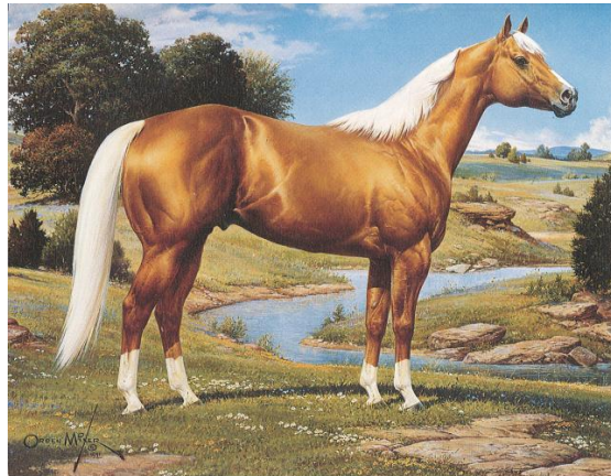
Palomino Stallion (PS)